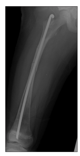
Figure 1: Right femur Rush rod fixation in a girl aged 9 years and 8 months. The rod tip was in distal epiphysis (group A).

The 61 femoral roddings were classified into two groups by the location of the Rush rod tip. In group A, the Rush rods penetrated physis and entered distal femoral epiphysis [Figure 1]. In group B, the Rush rods did not penetrate physis and stopped at distal femoral metaphysis [Figure 2]. There were 38 roddings in group A and 23 in group B. To study the longevity of each femoral rodding, we defined failure of fixation when revision surgeries were performed or when the Rush rod tip was cut out of the metaphyseal cortex of the distal femur, but revision was not scheduled for clinical reasons [Figure 3]. Longevity of fixation, revision rate, and other background characteristics were compared between the two groups using the Student's t-tests for continuous variables and Chi-square test for categorical variables. Kaplan-Meier survival analysis was used to compare the longevity of