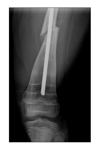
Figure 2: Left femur Rush rod fixation in a boy aged 9 years and 3 months. The rod tip was in metaphysis (group B).

Figure 1: Right femur Rush rod fixation in a girl aged 9 years and 8 months. The rod tip was in distal epiphysis (group A).