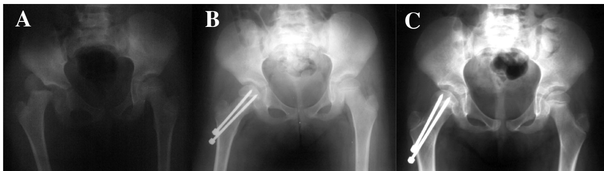
Fig. 2 Premature physeal closure after a type 1 femoral neck fracture. (A) Type 1 femoral neck fracture-dislocation in a 8-year-old boy. (B) Open reduction and internal fixation 3 days after injury. (C) Follow-up radiography after 6 months showing premature physeal closure.