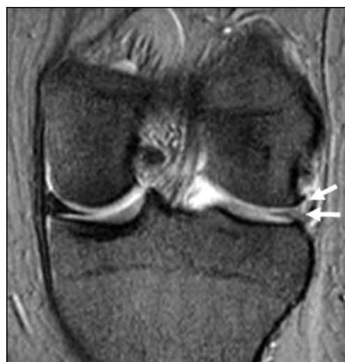
Fig. 1 A 25-year-old male with a basketball injury had experienced pain, locking, and effusion in his left knee for 3 weeks. Magnetic resonance imaging demonstrated a peripheral tear of the lateral meniscus (white arrows).

From October 2004 through September 2006, 31 arthroscopic meniscal repairs in 31 consecutive patients were performed by the senior author (YS Chan) using the FasT-Fix Meniscal Repair Suture System (Smith & Nephew) and the arthroscopic technique described below. In this prospective study, pre-operative evaluations included assessment of any effusion of the injured knee joint, the joint's range of motion, the stability of knee joint, the joint line tenderness, and an administration of the McMurray test. All patients had a magnetic resonance image study of the injury to the knee (Fig. 1). The inclusion criteria for this study were (1) a vertical full-thickness tear greater than 10 mm in length, (2) the location of the meniscal tear being less than 6 mm from the meniscocapsular junction, (14) (3) fixation of the meniscus solely with the FasT-Fix system, (4) no former meniscus surgery, and (5) no evidence of arthritis during arthroscopy. Isolated anterior cruciate ligament (ACL) deficient knees without concomitant collateral ligamentous injuries were reconstructed using a hamstring autograft at the time as the meniscal repair. Institutional Review Board approval (CGMH 98-0563B) was obtained before initiating the study. All patients gave their informed consent to participate.