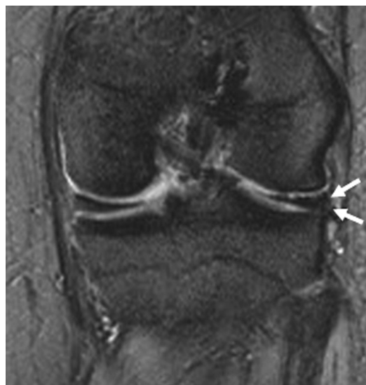
Fig. 3 Magnetic resonance imaging demonstrates a complete healing of the torn lateral meniscus after all-inside meniscal repair with the FasT-Fix meniscal repair system at one year postoperatively (white arrows). The patient had returned to vigorous sports with excellent knee function.

At the most recent follow-up, no symptoms of meniscal tears were observed in 30 (96.8%) cases (Fig. 3). One patient (3.2%) reported tenderness on joint-line palpation. No patient had exhibited any locking episodes. Only one case (3.2%) was consid-