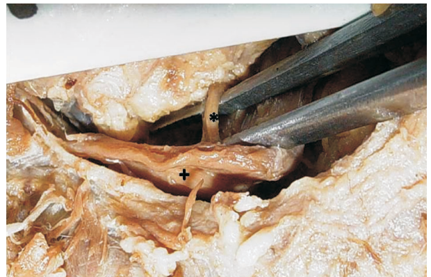
Fig. 2 Photograph taken at the front of the face showing the oculomotor nerve (*) entering the inferior oblique muscle (+) through its ocular surface.